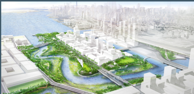
IMAGE 1: Rendering of the planned redevelopment of the Port Lands.

The Port Lands Area is an 880 acre, historically industrialized, brownfield site that is being redeveloped into new public spaces and naturalized to control water flow and manage sediment. Formerly the area was used for industries including petroleum refining and storage, equipment manufacturing, steel foundries, liquid and solid waste management, vehicle maintenance/repair operations, and municipal services. The redeveloped area will include parks, flood protection, bridges and structures, roads and municipal infrastructure (IMAGE 1).