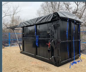
IMAGE 2: Hottpad™ pilot-scale unit used to treat contaminated soils.

Pilot testing of both STAR (in situ) and STARx (ex situ) was conducted in 2018 to assess the treatment of petroleum hydrocarbon impacted soil as a more sustainable and cost-effective alternative to off-site disposal (IMAGE 2). The pilot STAR and STARx systems consisted of a system trailer, heating elements for ignition, air distribution system to support the smoldering combustion reaction, as well as a vapor collection and treatment system.