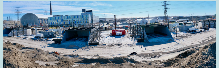
IMAGE 3: STARx Hottpad Plant capable of treating soils to site-specific re-use criteria

Savron was part of a team selected for the remediation of soils to be excavated from the new river channel. The Hottpad™ Plant constructed for this project consisted of four individual pads operating concurrently, with a total batch capacity of 1000 m 3 (i.e., 250 m 3 per pad) (IMAGE 3).